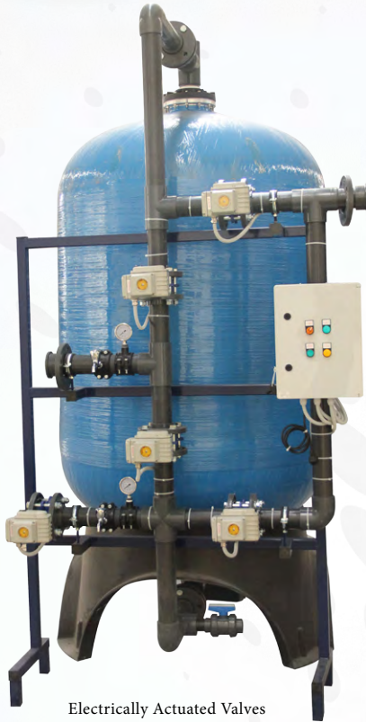
Electrically Actuated Valves