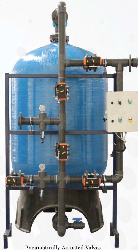
Pneumatically Actuated Valves